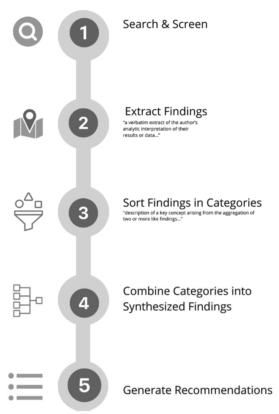
Fig. 1. Summary of the meta-aggregation approach with key terms and definitions.<sup>23</sup>

process outlined in the PRISMA flow diagram. One author of this systematic review (KM) was an author on one of the included studies<sup>3</sup> but was not involved in the screening or appraisal steps of the synthesis process.